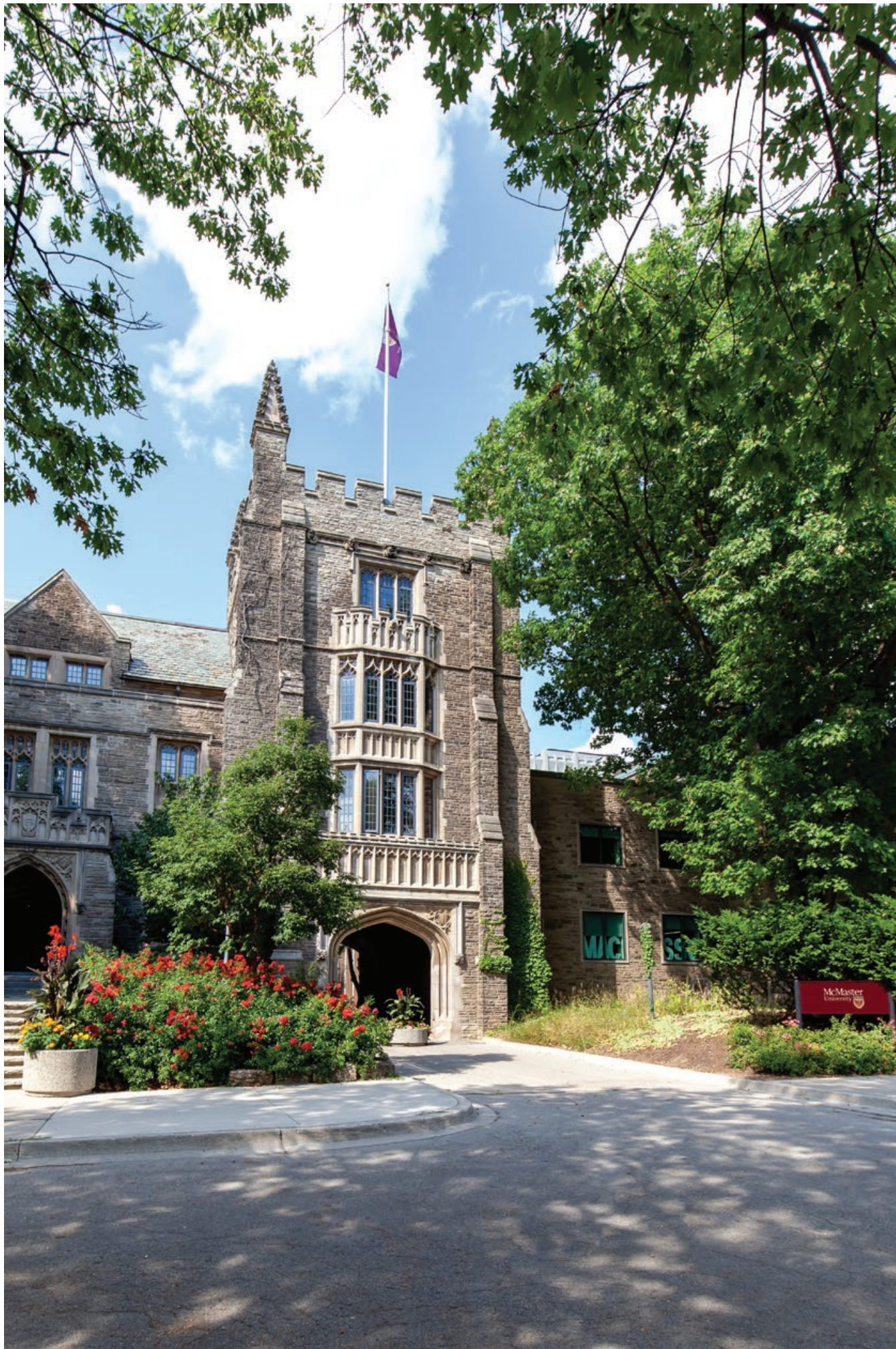
McMaster University 1280 Main St. W.

A leader in health and technology education, Mohawk is also one of the largest trainers of apprentices in Ontario, and it's among the top 10 colleges in Canada for applied research. The institution offers more than 150 programs, including award-winning collaborative degree programs with McMaster University. Mohawk is home to more than 33,000 full-time, part-time, apprenticeship and international students.