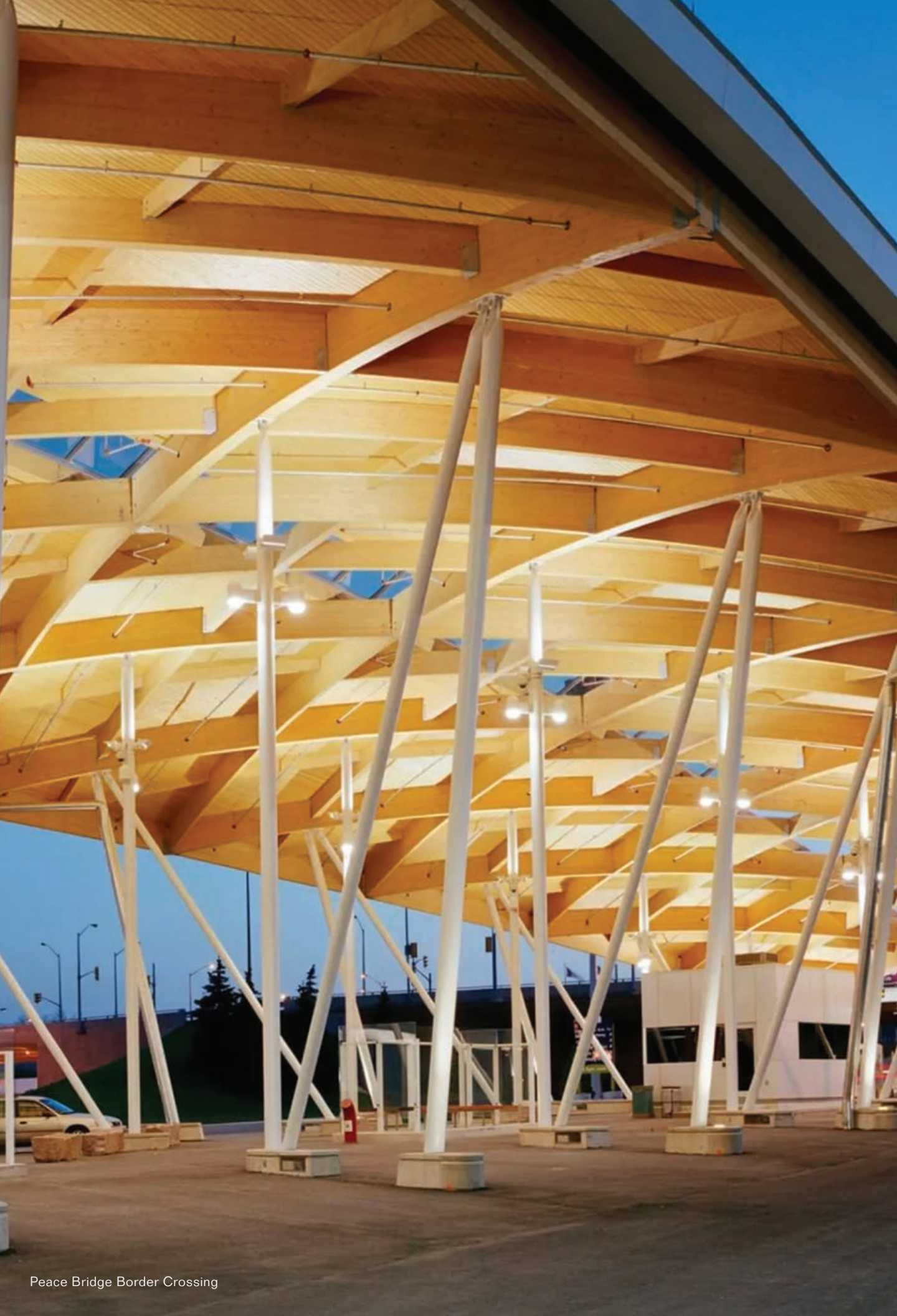
Peace Bridge Border Crossing