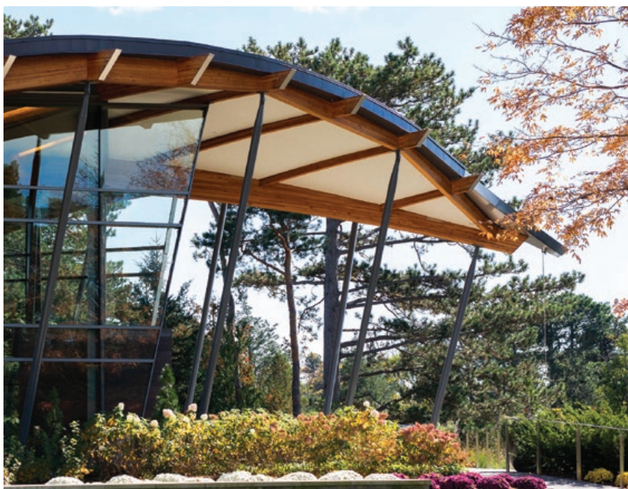
Royal Botanical Gardens