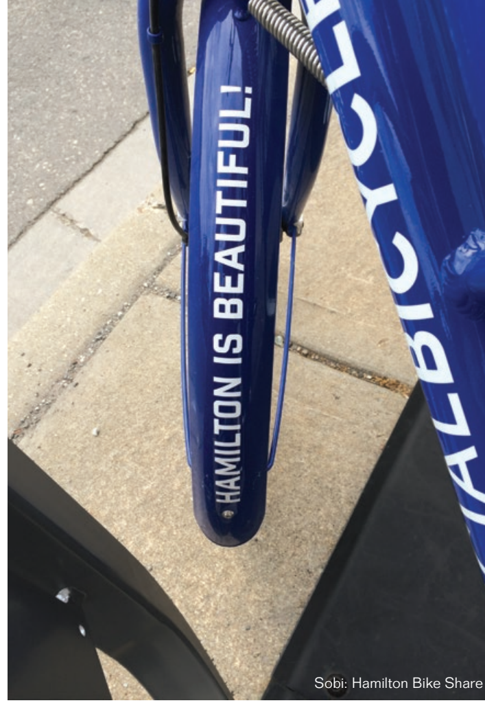
Sobi: Hamilton Bike Share