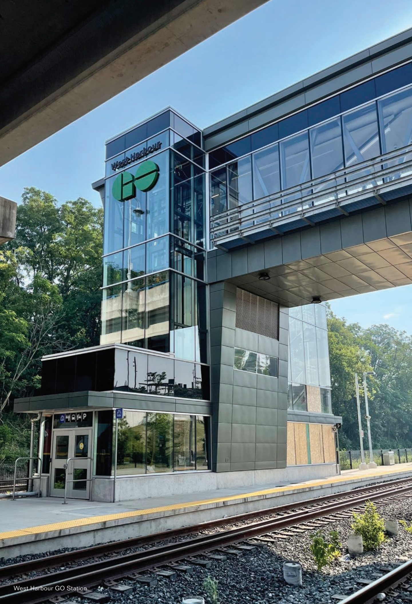
West Harbour GO Station