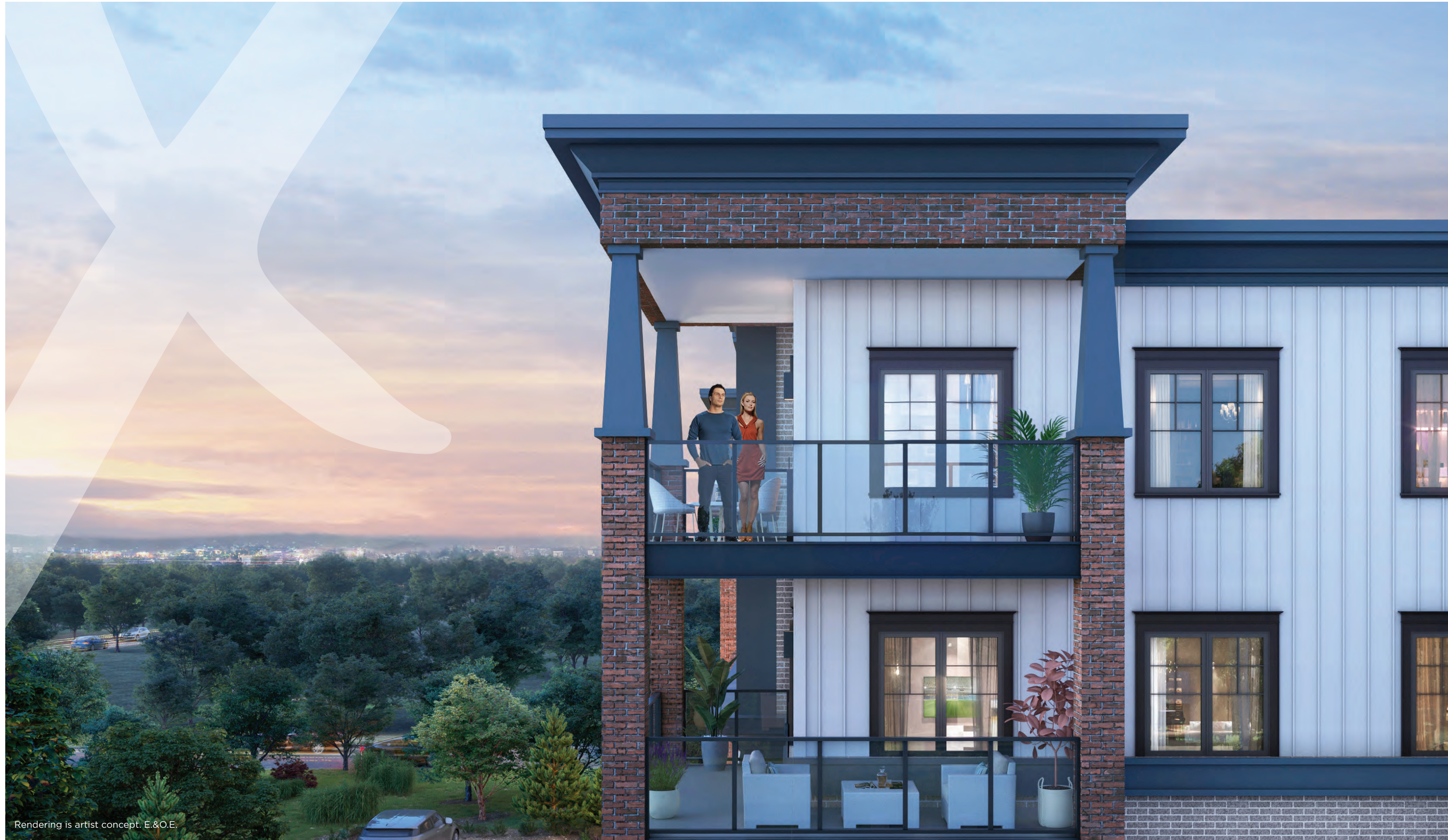
Rendering is artist concept. E.&O.E.

Light pours through your new home at The Brix. With oversized windows and balcony doors, your view of the hills of Creemore is unparalleled. Enjoy your new home's architecture, inspired by the traditional homes of the county, and paired with the chic conveniences of contemporary design to create something unique in the area.