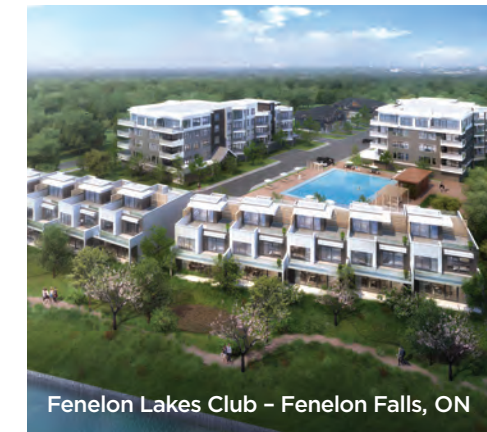
Fenelon Lakes Club – Fenelon Falls, ON