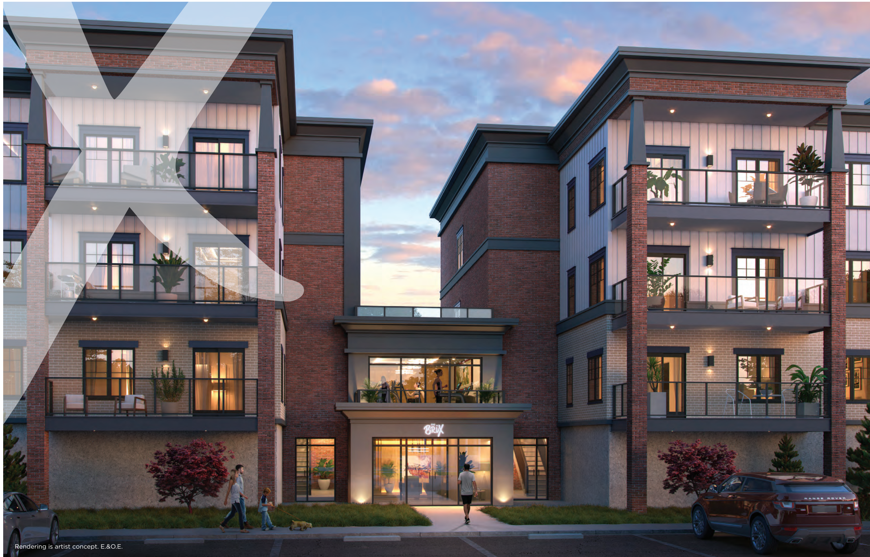
Rendering is artist concept. E.&O.E.