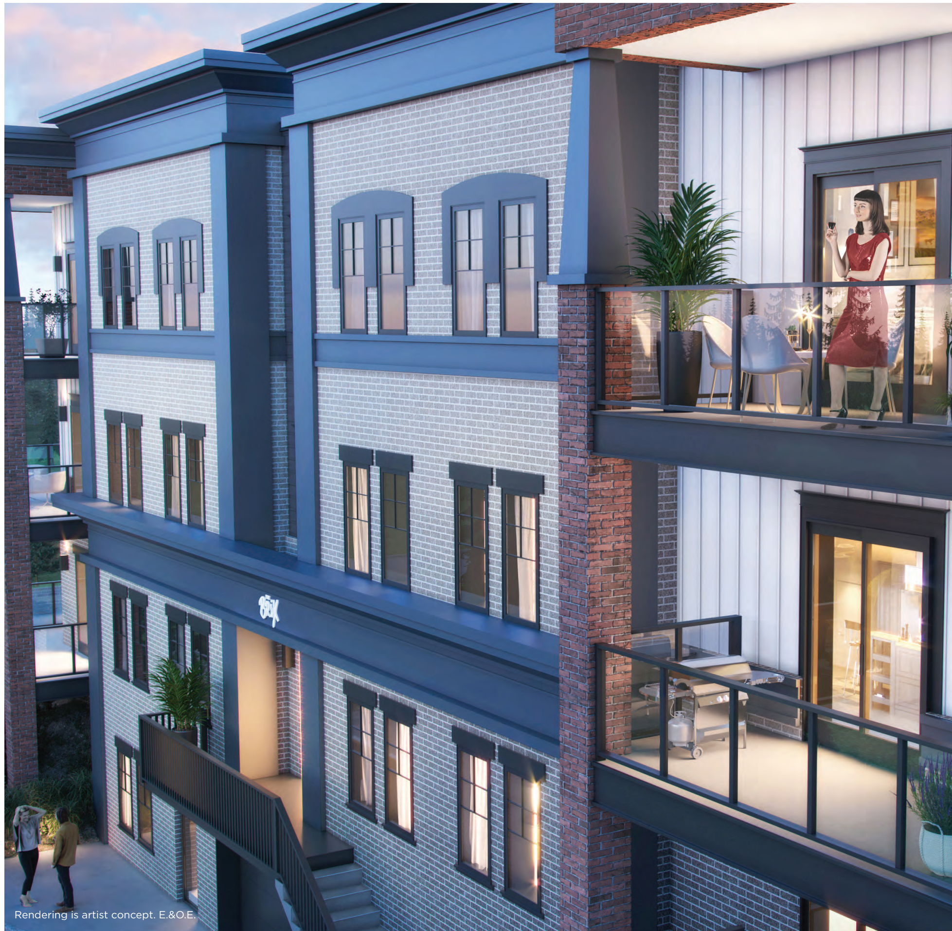
Rendering is artist concept. E.&O.E.

LIVEMOREXPLAYMOREXEXPLOREMOREXLAUGHMOREXTHERE'SMORETOLIFEATTHEBRIX