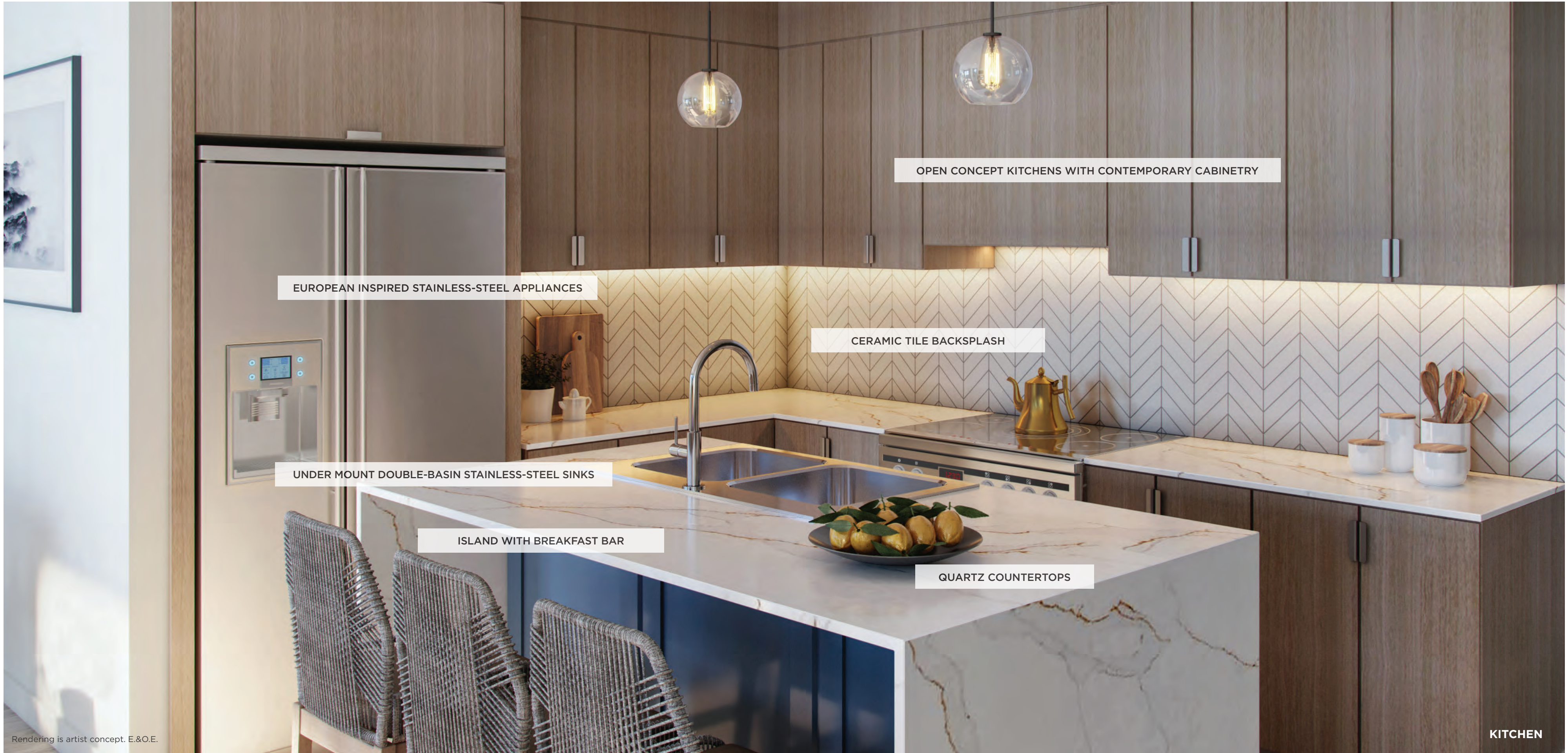
EUROPEAN INSPIRED STAINLESS-STEEL APPLIANCES