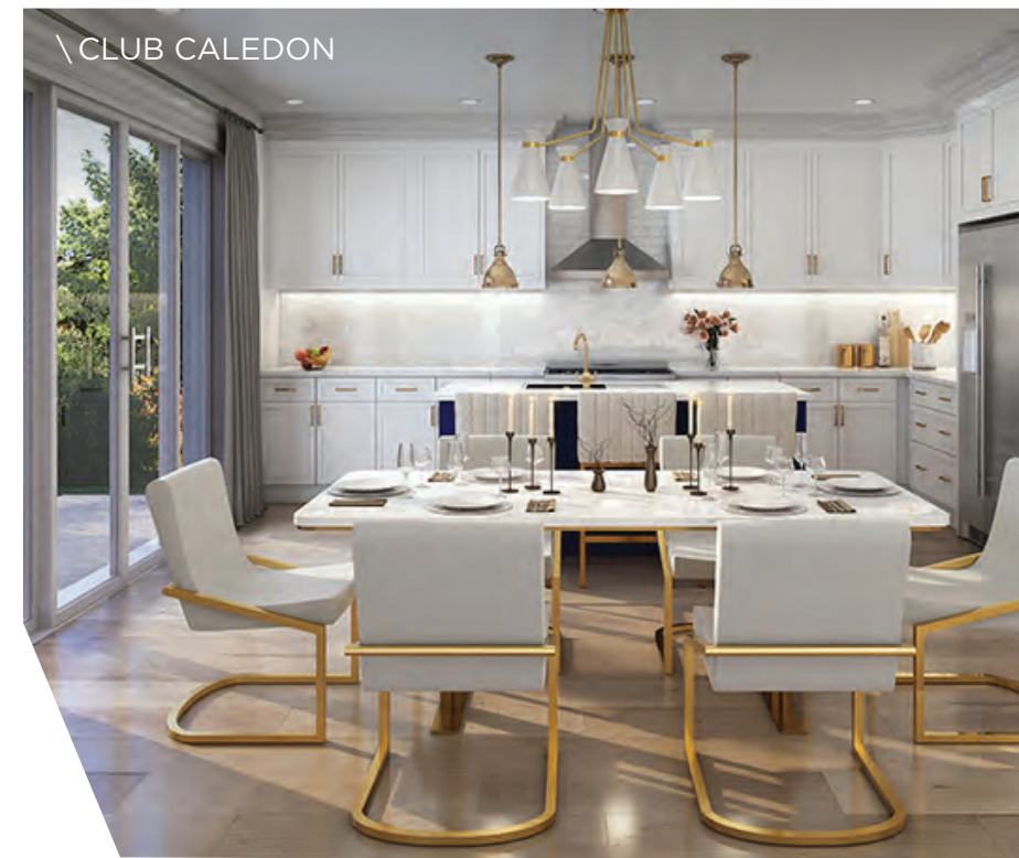
\ CLUB CALEDON