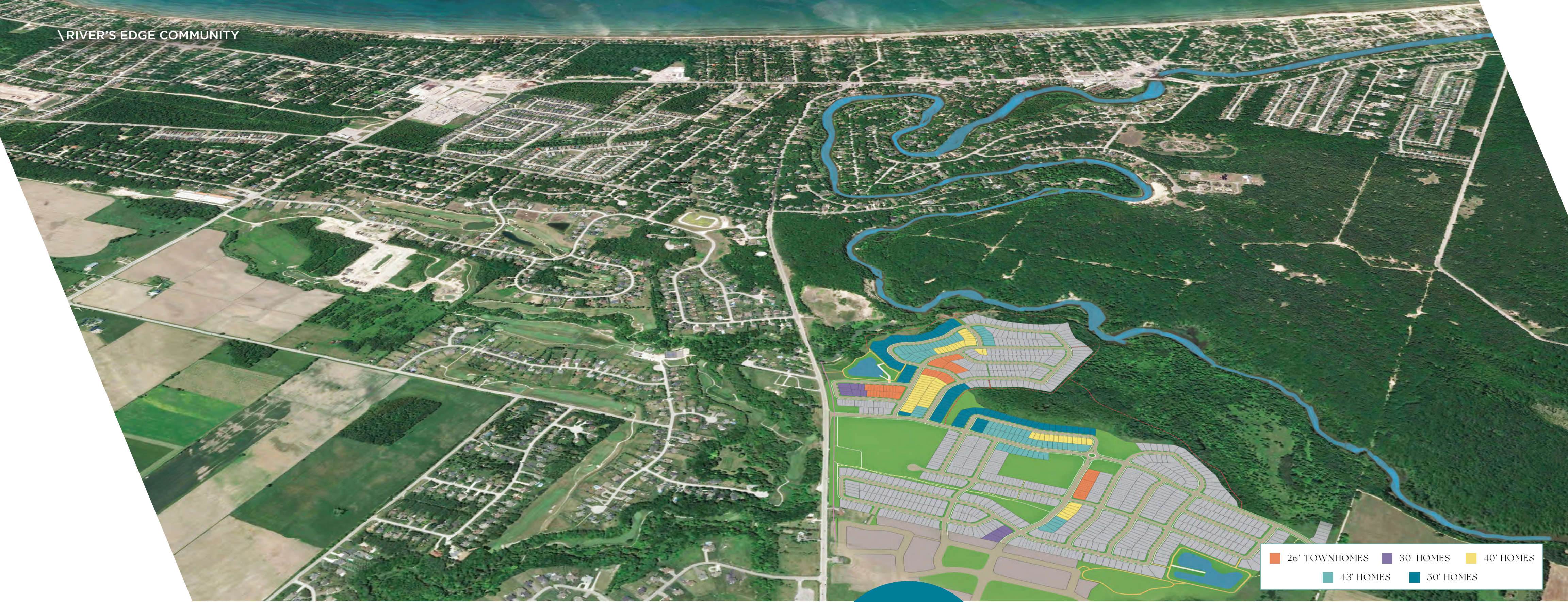
Map not to scale. Artist concept. E.&O.E

26' TOWNHOMES 30' HOMES 40' HOMES 43' HOMES 50' HOMES