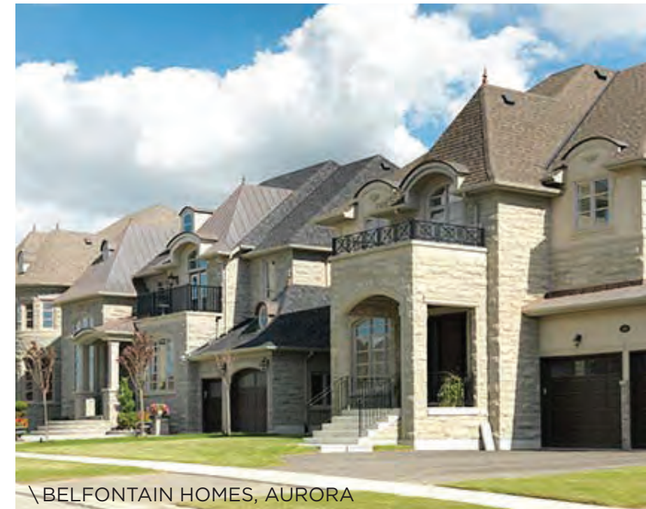
\ BELFONTAIN HOMES, AURORA