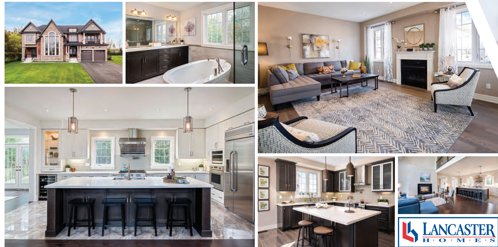
Renderings are artist concept and not to scale. E.&O.E

From affordable starter homes to beautiful brick and stone estate designs, with communities surrounding lower Lake Simcoe, Niagara Region and North Oshawa, Lancaster Homes views homebuilding as an opportunity to create something of timeless beauty and lasting value. In a Lancaster Homes community, you'll experience the warm and friendly lifestyle of a well-planned neighbourhood centered upon distinctive homes built to exacting standards of excellence.