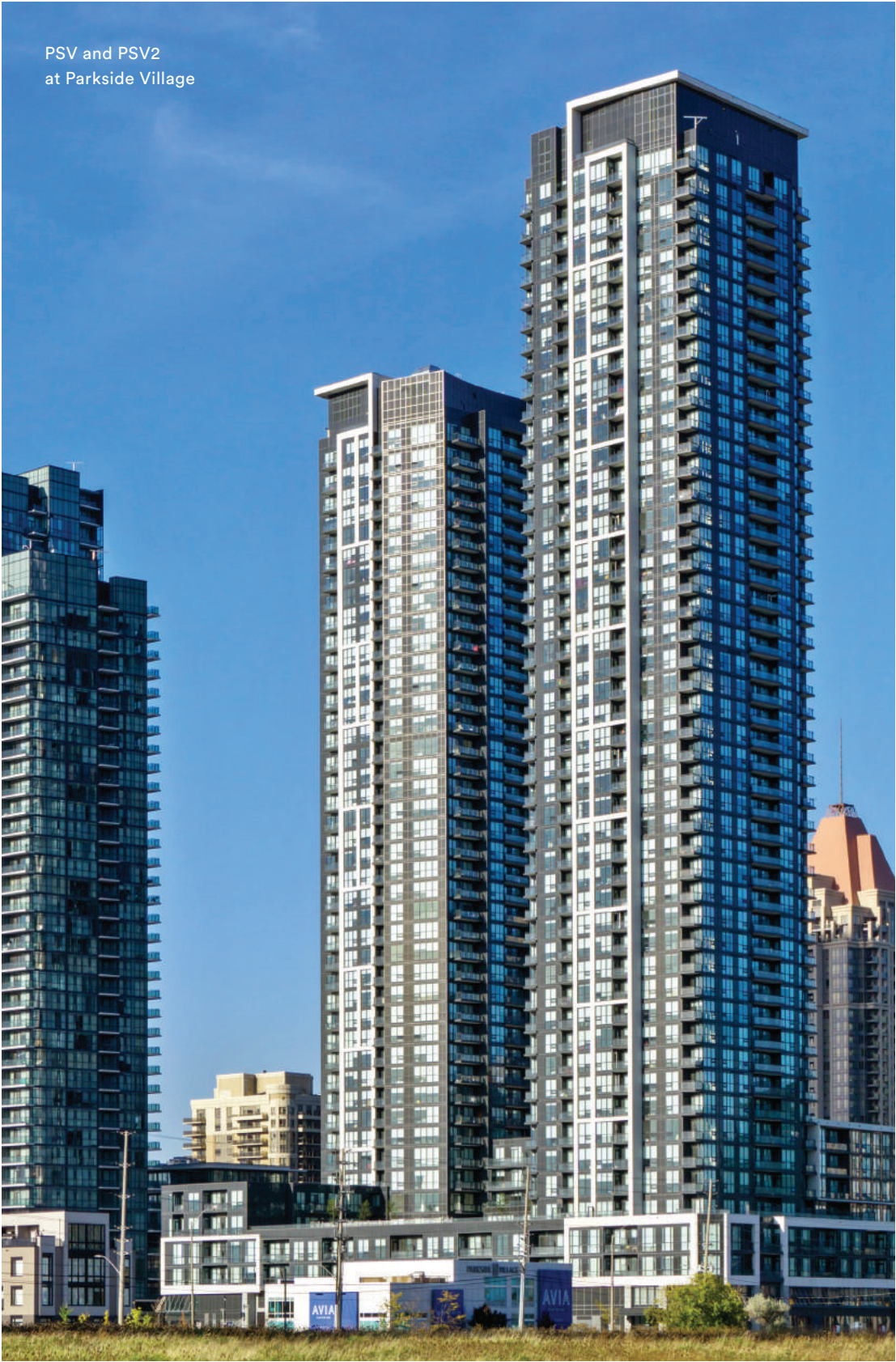
PSV and PSV2 at Parkside Village