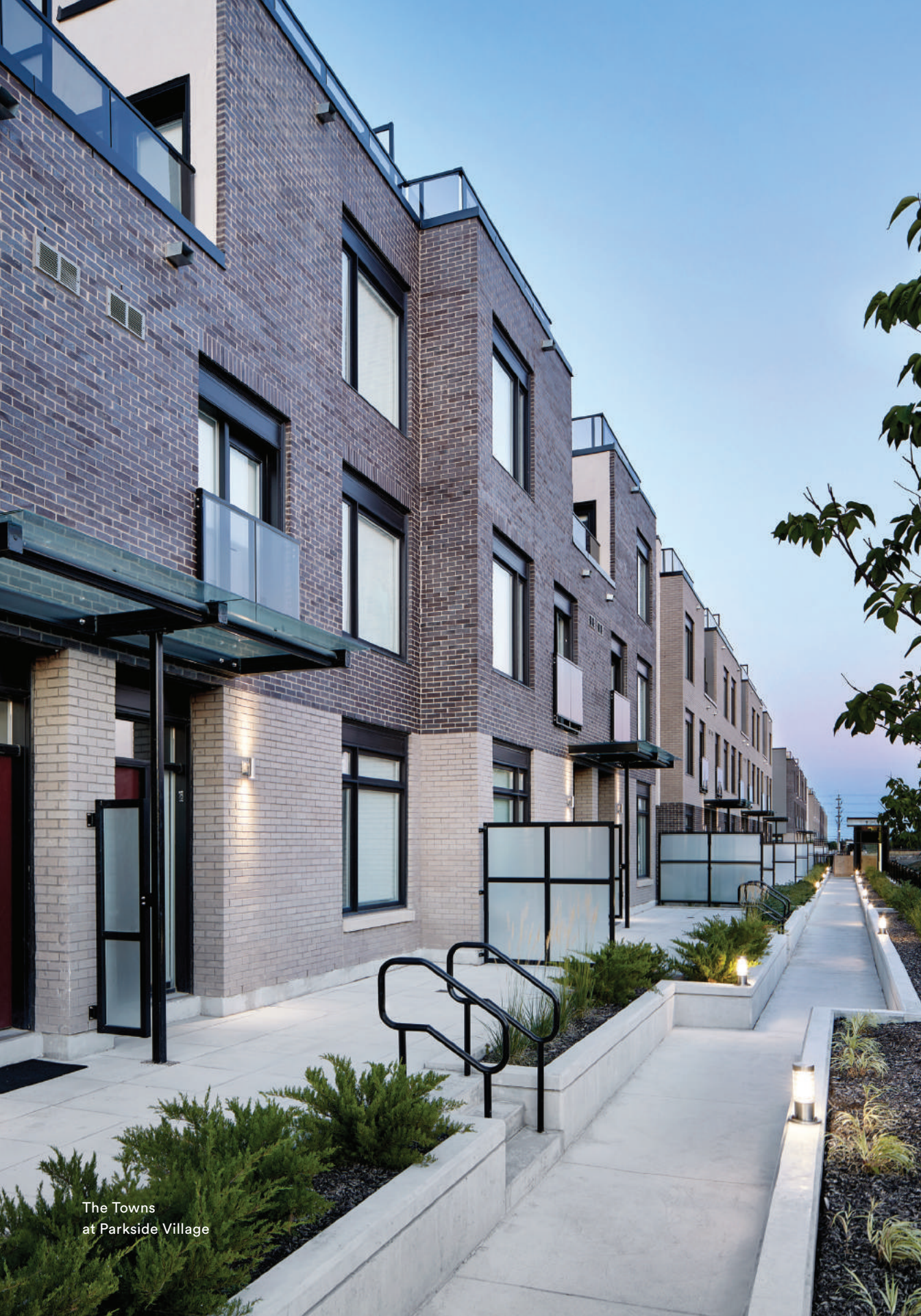
The Towns at Parkside Village