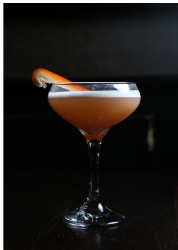
Chiang Mai: Experience a taste of Thailand close to home at this stylish spot serving flavourful dishes and cocktails.